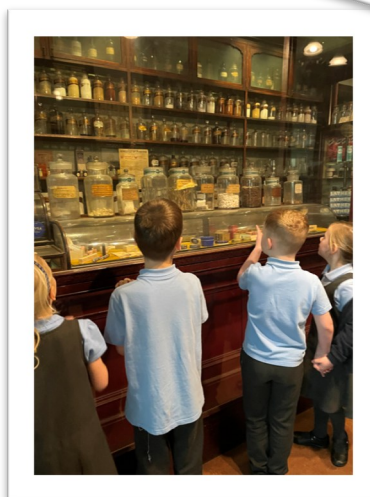
Year 1 at the Streetlife Museum

Kingswood Parks Primary School takes seriously its responsibility to safeguard all children and adults and have rigorous procedures in place to do so.